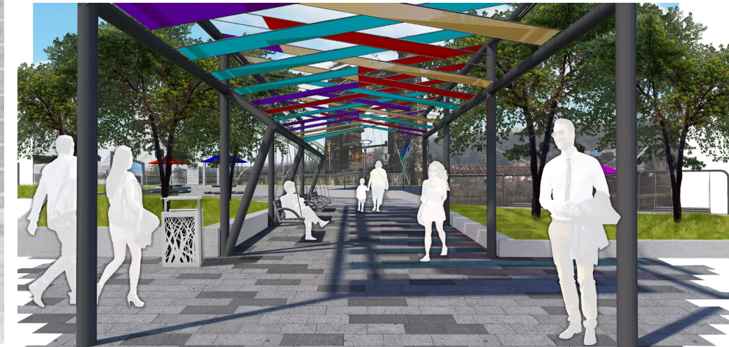
Shade Structure and Terrace Plaza