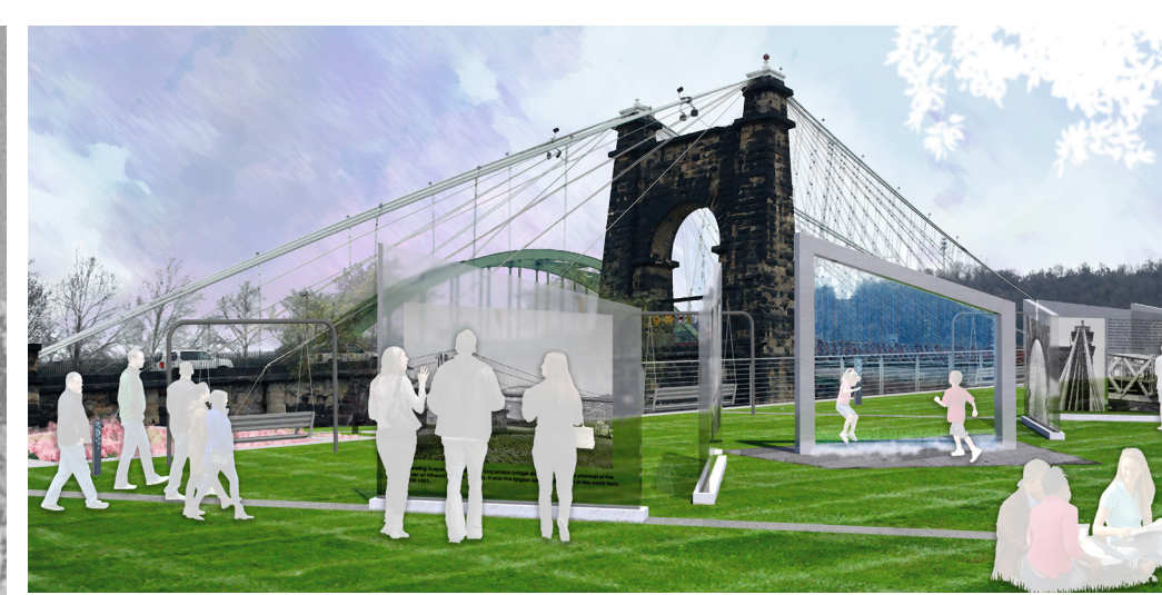
History Walk and Green